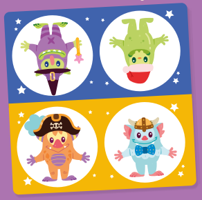
For this Costume Card, the Blue Team takes Norguz and Gelito, and the Yellow Team takes Cornak and Touffux.

The Blue Team takes the 2 Monster Cards with the blue background, and the Yellow Team takes the 2 Monster Cards with the yellow background.